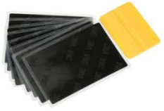
3M™ Polyurethane Protective Boot SJ8542HS, FP641, Matte Black, 4 in x 6 in