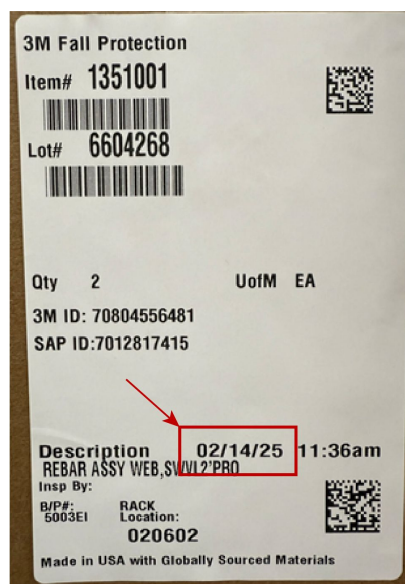
Figure 3: Outside label displaying Manufacture Date

If you have any questions, please contact our Technical Service Team: