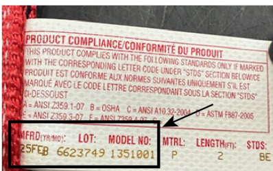
Figure 1: Device information label displaying Manufacture Date and Model Number

Step 2: For Rebar/Positioning Lanyards: Find and inspect the quick links attached to the hooks. There should be two quick links on any affected models. Affected quick links will not have any Safe Working Load (SWL) stamped on them (see Figure 2). If quick link is