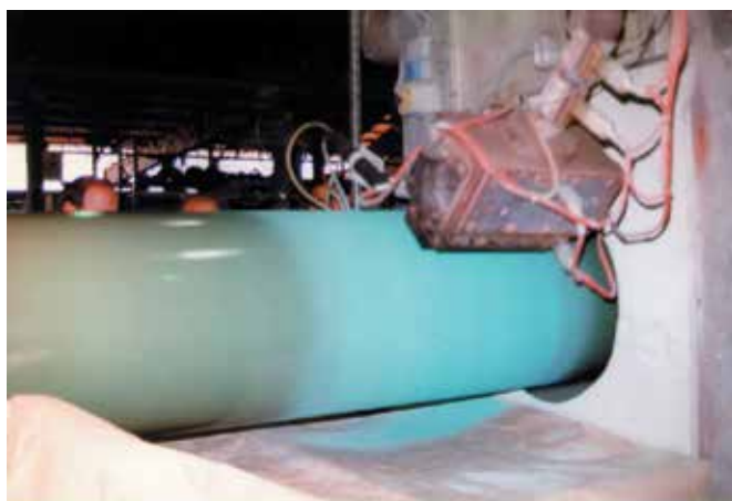
Application of 3M™ Scotchkote™ Coating 207R to pipe.

3M™ Scotchkote™ Fusion Bonded Epoxy Coating 207R is a rough overcoating. Restricted flow and optimized components produce a granular finish on all Scotchkote pipe-coating products where increased surface roughness is required. Scotchkote overcoating 207R was specifically developed to help provide added traction for guide/feed wheels used in the installation of offshore pipelines. It reduces slippage between fusion bonded epoxy and a concrete overcoat and helps provide safer footing. Bendability exceeds requirements of ANSI B31.4 or B31.8 Codes.