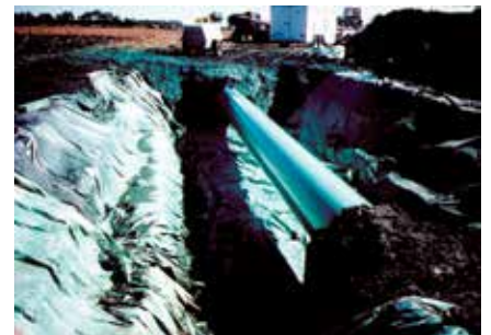
Completed pipe coating rehabilitation using 3M™ Scotchkote™ Liquid Epoxy Coating.