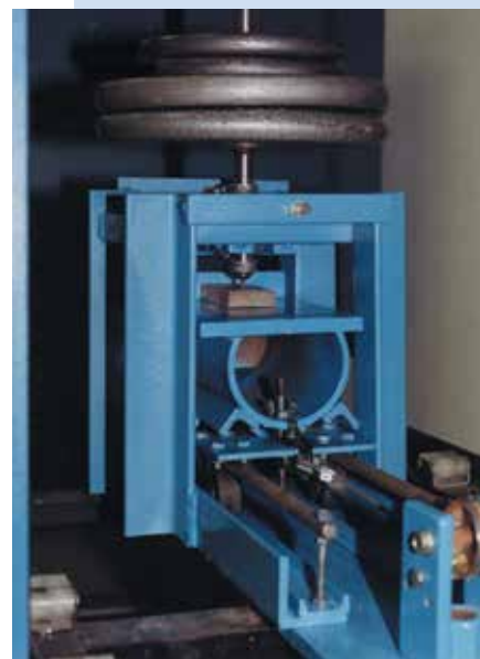
Gouge test simulates the stresses on a coating during a horizontal pipe pull. The coating sample is dragged under a weighted bit and the gouge depth is measured.