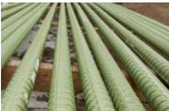
Application of 3M™ Scotchkote™ Epoxy Coating on rebar.