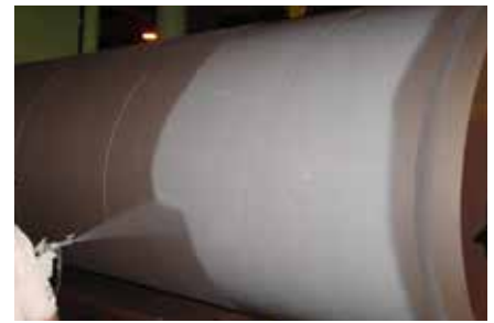
Cleaning pipe to a white finish for a rehab project.

3M™ Scotchkote™ Spray System HSS-450 is intended for use in a wide variety of spray applications using 3M™ Scotchkote™ Liquid Epoxy Coating 323 and 3M™ Scotchkote™ Liquid Epoxy Coating 327. It is designed for use where fast and easy setup, no clean up, minimal material waste and essentially no equipment maintenance are highly desirable.