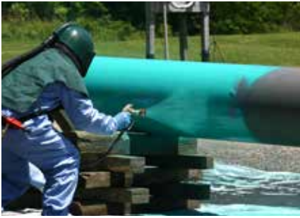
Completed pipe coating rehabilitation using 3M™ Scotchkote™.