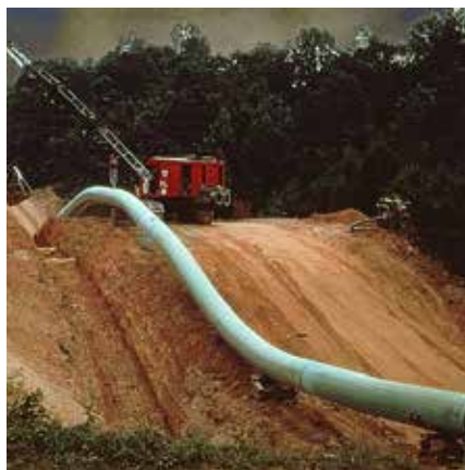
Pipeline coated with 3M™ Scotchkote™ Fusion Bonded Epoxy Coating