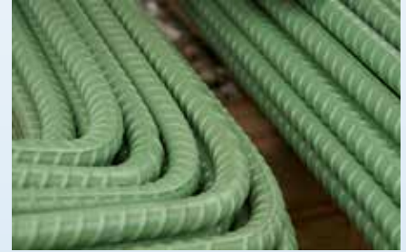
Rebar coated with 3M™ Scotchkote™ FBE 413

3M™ Scotchkote™ Fusion Bonded Epoxy Rebar Coating 413SG Spray Grade Coating is designed for application on welded wire fabric, mesh, chair assemblies, dowel baskets, cable-tensioning hardware, screw anchors and coupling devices. The coating possesses high flow capability without sag for maximum penetration into wire intersections and coverage on sharp weld cusps. Gel and cure time and have been extended to aid in this process, therefore the coating must be post baked. Scotchkote FBE rebar coating 413 spray grade meets all standards for coating of reinforcing steel prior to fabrication.