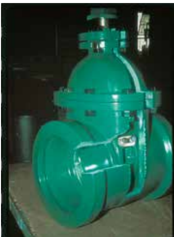
3M™ Scotchkote™ FBE Coating covers all surfaces if this valve assembly.