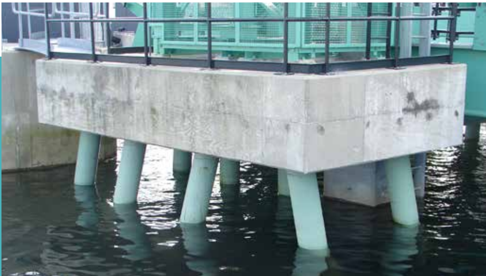
Pipe piling coated with 3M™ Scotchkote™ FBE 6233

3M™ Scotchkote™ Fusion Bonded Epoxy Coating 6233 is a fusion bonded epoxy powder coating utilizing special adhesion promoting agents to enhance cathodic disbondment resistance. Protects even under the stress of changing temperatures and soil compaction.