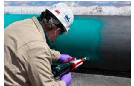
3M™ Scotchkote™ Liquid Epoxy Coating 323 being applied to a pipe for a rehabilitation project.