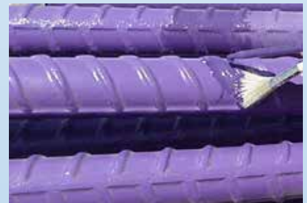
3M™ Scotchkote™ Fusion Bonded Epoxy Rebar Coating 426

3M™ Scotchkote™ Fusion Bonded Epoxy Rebar Coating 426 meets the rigid standards of ASTM A 934/934 M for coating of reinforcing steel in “after-fab” application. Like Scotchkote pipe-coating materials, Scotchkote FBE rebar coating 426 incorporates special adhesion promoting agents for enhanced corrosion protection and chemical resistance properties making it suitable for marine or harsh environments. These materials are specially formulated for use in a variety of straight bar and custom applications with prefabricated steel part configurations and accessories. Scotchkote FBE rebar coating 426 is available in two gel/cure times for application to straight or prefabricated rebar sections.