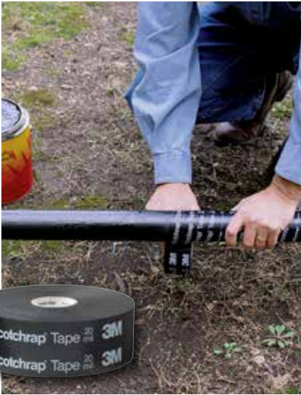
3M™ Scotchrap™ Corrosion Protection Tapes

3M™ Scotchrap™ Corrosion Protection Tapes are tough, polyvinyl chloride based tapes with special high tack adhesives formulated to resist corrosion of metal fittings, field joints, and electrical conduit systems. They are resistant to corrosive salt water, soil acids, alkalis and salts, common chemicals, chemical vapors and exposure to outdoor weathering and sunlight. They are also resistant to impact, abrasions, punctures, and tears.