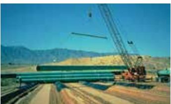
Stacked pipe with 3M™ Scotchkote™ Coating ready for installation.