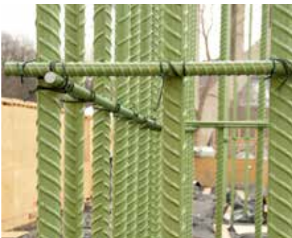
Rebar coated with 3M™ Scotchkote™ FBE Coating 413 being used in a bridge project