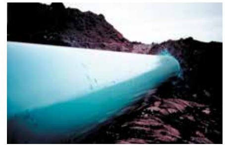
Pipe rehabilitation completed using 3M™ Scotchkote™ FBE Coating – and repaired with 3M™ Scotchkote™ Liquid Epoxy Coating.