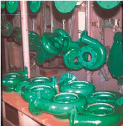
Pump volutes protected against corrosion with 3M™ Scotchkote™ FBE Coating 134.