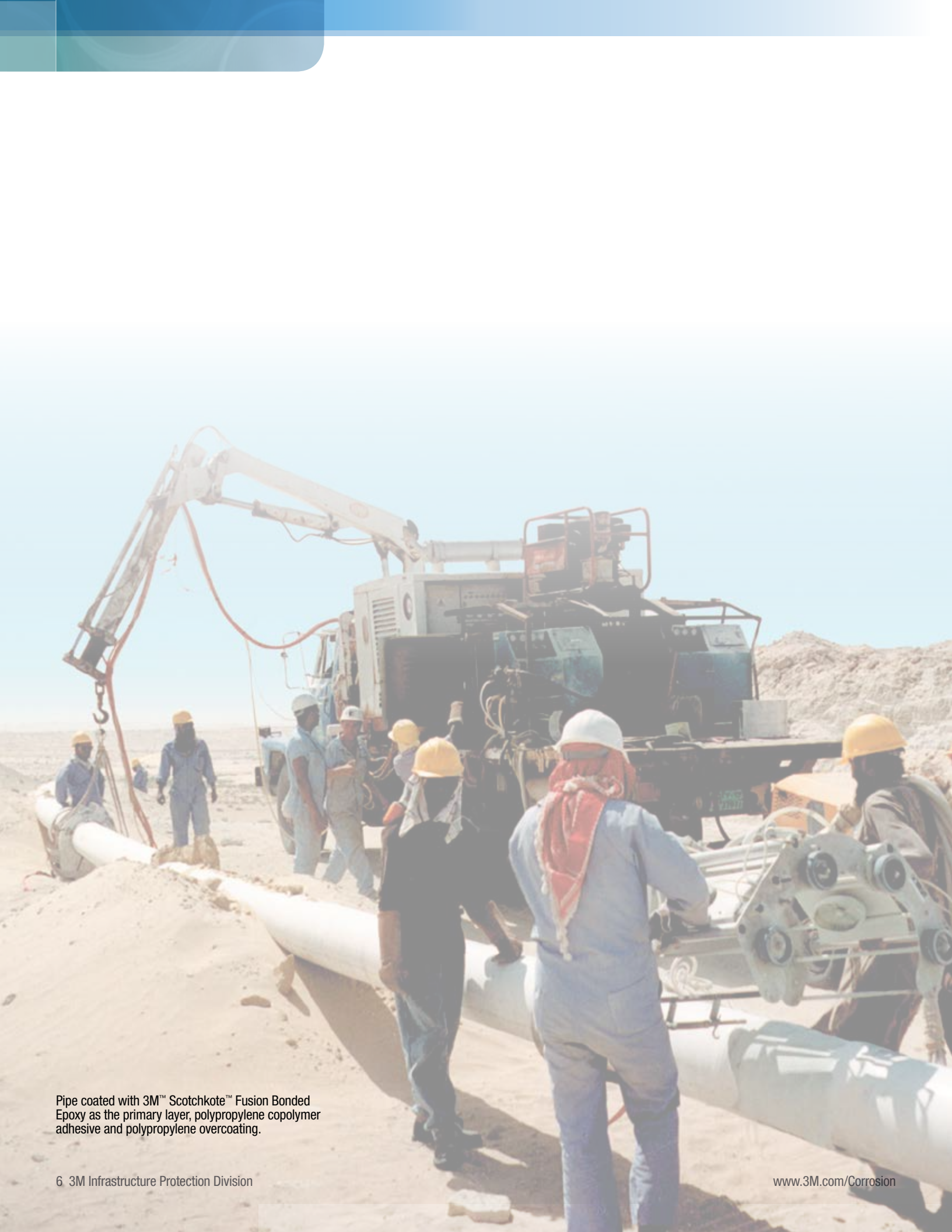
Pipe coated with 3M™ Scotchkote™ Fusion Bonded Epoxy as the primary layer, polypropylene copolymer adhesive and polypropylene overcoating.