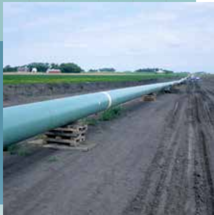
The Alliance Pipeline in Minnesota was coated with 3M™ Scotchkote™ Coating 6233.

3M™ Scotchkote™ Fusion Bonded Epoxy Coating 626 series offers solutions to address new challenges and needs for high-temperature pipeline coatings in the oil and gas industry. These Scotchkote coatings help protect oil and gas pipelines against corrosion while they operate at high temperatures. 3M™ Scotchkote™ Fusion Bonded Epoxy Coating 626-120 can operate up to 115° C as a standalone coating. 3M™ Scotchkote™ Fusion Bonded Epoxy Coating 626-140 can withstand temperatures up to 135° C as a standalone coating, and 3M™ Scotchkote™ Fusion Bonded Epoxy Coating 626-155 can withstand temperatures up to 150° as a standalone coating.