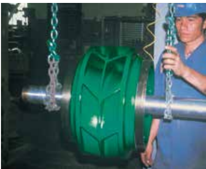
Application of 3M™ Scotchkote™ FBE Coating 134 custom coating on a turbine.