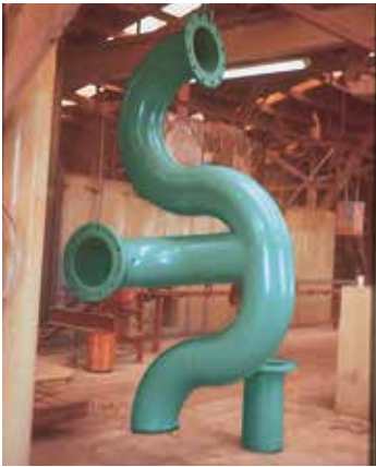
Header piping for a water purification plant illustrates the types of complex shapes that can be coated with 3M™ Scotchkote™ Coatings.