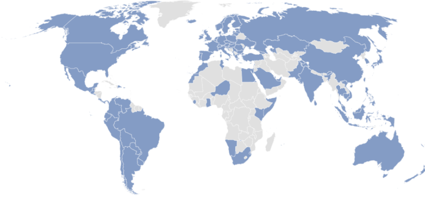
Supplier locations by country

The global economy has been impacted by military conflicts, including the conflict between Russia and Ukraine. The U.S. and other governments have imposed export controls on certain products and financial and economic sanctions on certain industry sectors and parties in Russia. 3M suspended operations of its subsidiaries in Russia in March 2022 and completed a sale of the related assets in June 2023. See 3M's Annual Report on Form 10-K for further details.