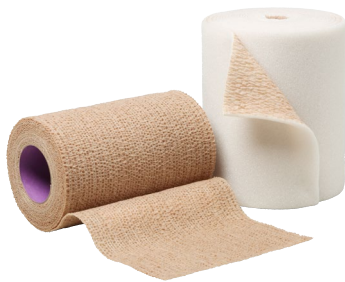
3M™ Coban™ 2 Two-Layer Compression System