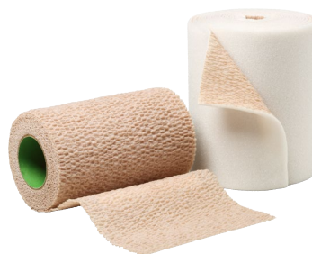
3M™ Coban™ 2 Lite Two-Layer Compression System