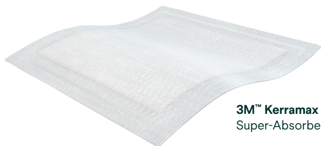
3M™ Kerramax Care™ Super-Absorbent Dressing

Chronic, highly exuding wounds are difficult for both clinician and patient. Excess fluid can make achieving an optimum moisture balance difficult and can lead to maceration.