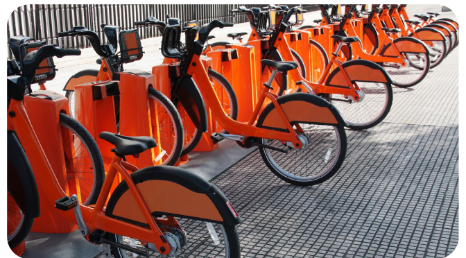
E-bikes are many times stored outdoors, giving them added exposure to the elements.