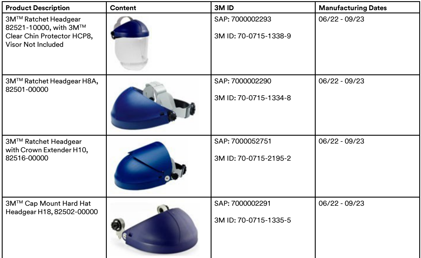
Table 2: Headgear