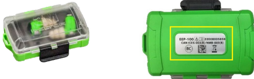
Table 1: Affected Part Numbers

As part of 3M's ongoing commitment to delivering high quality safety equipment, we are notifying our customers of a Product Advisory relating to label traceability on certain 3M™ PELTOR™ In-Ear Electronic Earplug Charging Cases. Product produced from December of 2021 to June of 2022 demonstrated varying levels of durability that could result in a loss of the regulatory and /or serial number traceability information related to the charging case. The In-Ear Electronic Earplugs maintain their individual identification information on the devices and are not a part of the Advisory.