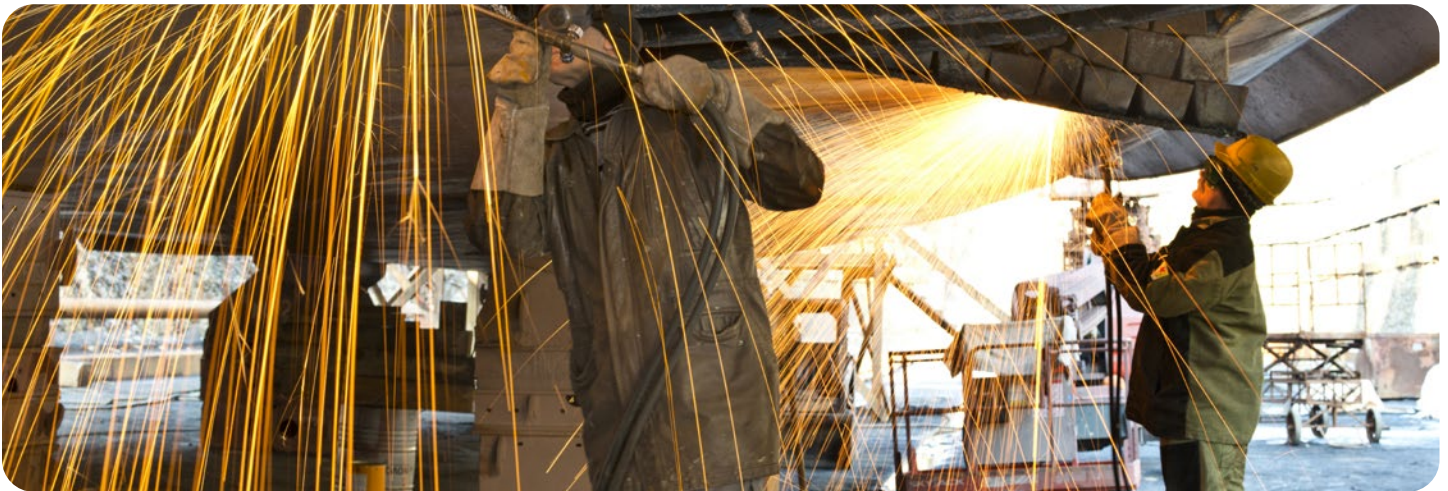
Workers welding seams on a ship hull while it's in drydock.