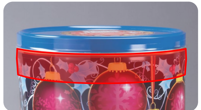
3M™ Vinyl Tape 471 can be used to seal food and gift tins when clean removal is important.