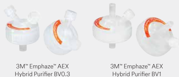
3M™ Emphaze™ AEX Hybrid Purifier BV0.3