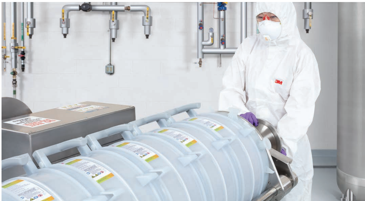
3M™ Encapsulated Production System holder in use

Intended Use: 3M™ Harvest RC products are intended for use in biopharmaceutical processing applications of aqueous based pharmaceuticals (drugs) and vaccines in accordance with the product instructions and specifications, and cGMP requirements (for BC340, BC1020, BC2300 and BC16000) or GLP requirements (for CT15, WP6, BC4 and BC25), where applicable.