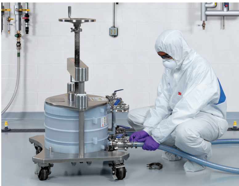
3M™ Encapsulated System Holder, 16EZA