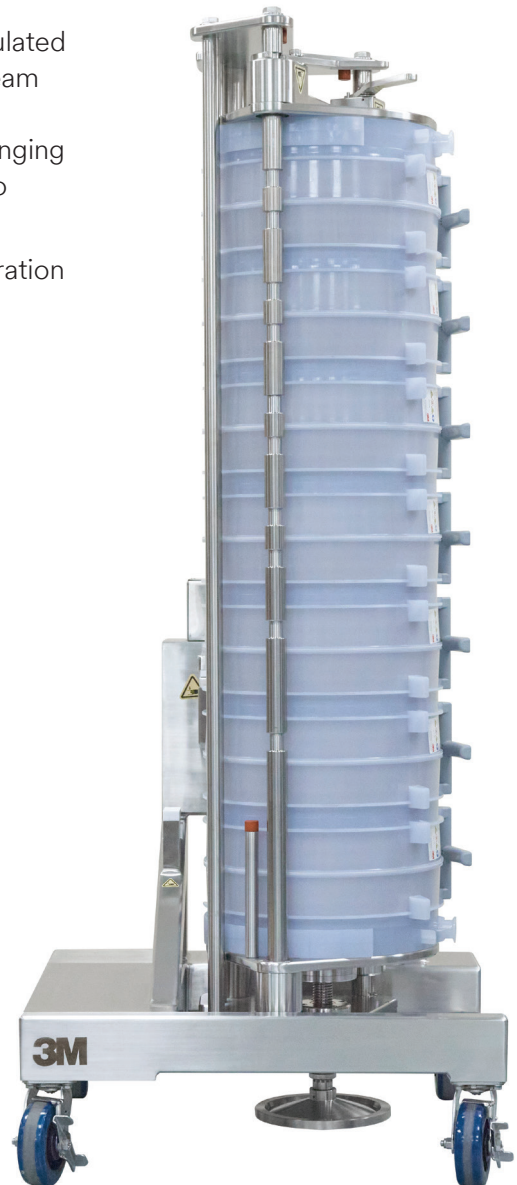
3M™ Encapsulated System Holder, Large 16EZB