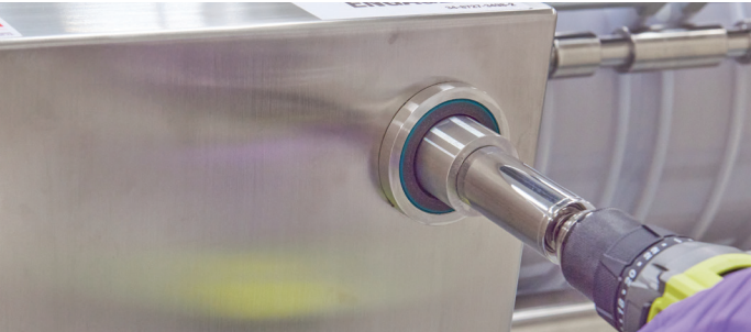
Compatible with Power Drill Adapter In Place of Manual Hand Lever