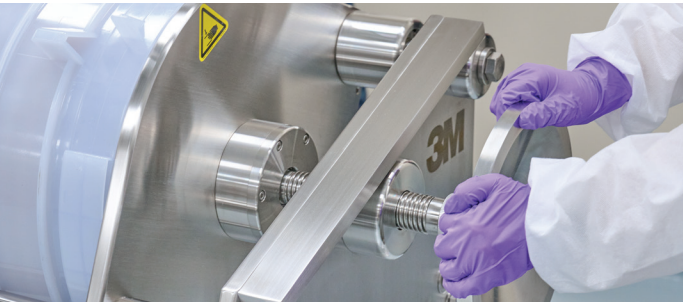
Ease of Operation