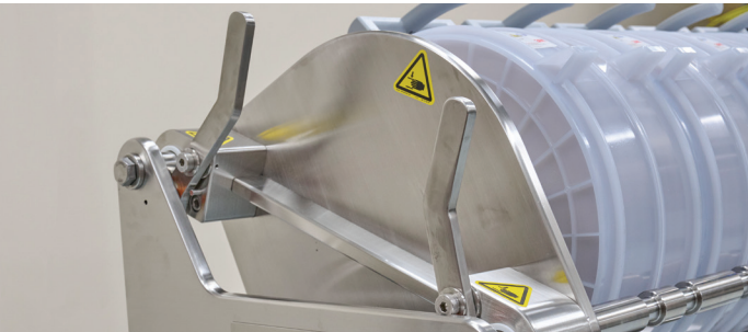
Two-Handle Locking Mechanism