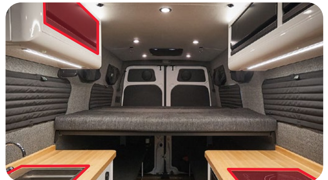
3M™ Heavy Duty Protective Tape 346 provides impact and scratch resistance to protect finished surfaces while work is being conducted on adjacent areas.