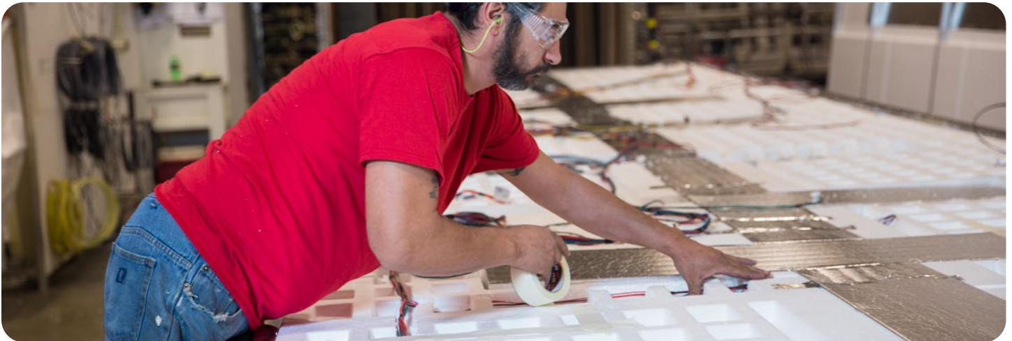
Headliners in automotive and specialty vehicle contain wire harnesses that need to be securely held by a robust tape such as 3M™ Aluminum Foil Tape 437.