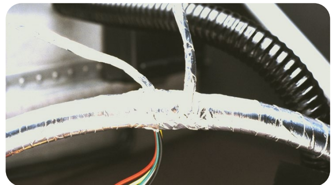
Delicate wires wrapped and protected from heating element in appliances using 3M™ High Temperature Aluminum Foil/Glass Cloth Tape 363.