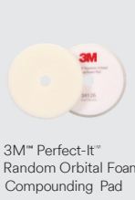
3M™ Perfect-It™ Random Orbital Foam Compounding Pad