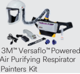
3M™ Versaflo™ Powered Air Purifying Respirator Painters Kit