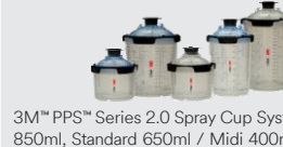
3M™ PPS™ Series 2.0 Spray Cup System Kit / Large 850ml, Standard 650ml / Midi 400ml, Mini 200ml