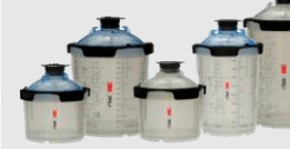
3M™ PPS™ Series 2.0 Spray Cup System