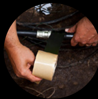
Splicing and sealing in outdoor areas