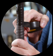
Insulate cable drops