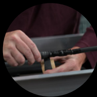
Splice cables in overhead cable trays