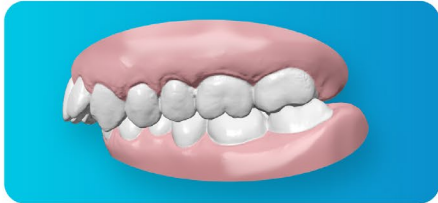
Class II Overbite