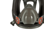
3M™ Full Facepiece Reusable Respirator 6800 Learn more