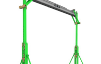
3M™ DBI-SALA® FlexiGuard™ A-Frame System Learn more