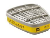
3M™ Organic Vapor/Acid Gas Cartridge 6003 Learn more