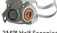
3M™ Half Facepiece Reusable Respirator 6200 Learn more