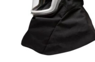
3M™ Versaflo™ Helmet with Highly Durable Shroud, M-406 Learn more