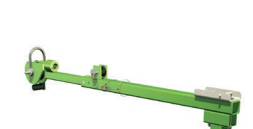
3M™ DBI-SALA® Confined Space Pole Hoist System 8530252 Learn more