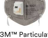
3M™ Particulate Respirator 9542V, KN95/P2 Learn more