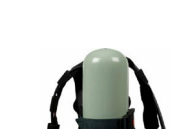
3M™ Scott™ Sigma-2 Type 2 SCBA Learn more