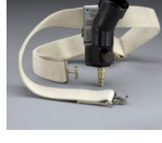
3M™ Versaflo™ Air Regulating Valve Assembly V-300 Learn more