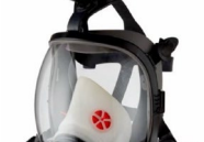
3M™ Scott™ Vision Nano-Lok™ Positive Pressure Facemask Learn more