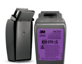
3M™ Secure Click™ Hard Case P100 Particulate Filter D9093 Learn more