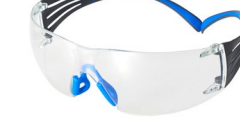
3M™ SecureFit™ Safety Glasses SF40ISGAF-BLU, Blue/Gray, Clear Scotchgard™ Anti-fog Lens Learn more