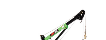
3M™ DBI-SALA® 5-Piece Hoist System Learn more