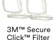
3M™ Secure Click™ Filter Retainer D701 Learn more