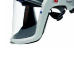
3M™ Secure Click™ Helmet with Comfort Faceseal, M-306 Learn more