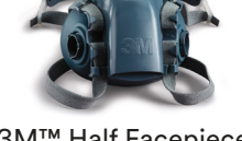
3M™ Half Facepiece Reusable Respirator 7502 Learn more