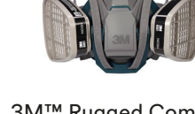
3M™ Rugged Comfort Quick Latch Half Facepiece Reusable Respirator 6502QL Learn more