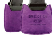
3M™ Secure Click™ aParticulate Filter D3091 Learn more