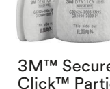
3M™ Secure Click™ Particulate Filter D7N11, N95 Learn more