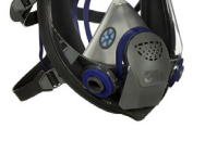
3M™ Ultimate FX Full Facepiece Reusable Respirator FF-402 Learn more