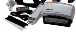
3M™ Versaflo™ Powered Air Turbo Starter Kit TR-619E Learn more