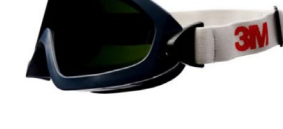
3M™ Safety Goggles, Sealed, Anti-Scratch / Anti-Fog, Welding Shade 5.0 Learn more