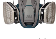
3M™ Rugged Comfort Quick Latch Half Facepiece Reusable Respirator 6502QL Learn more