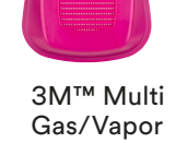
3M™ Multi Gas/Vapor Cartridge/Filter 60926 Learn more