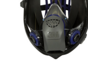
3M™ Secure Click™ Full Facepiece Reusable Respirator FF-800 Series Learn more