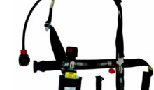
3M™ Scott™ Flite COV Airline Breathing Apparatus Learn more