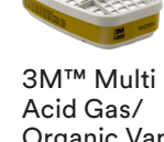
3M™ Multi Acid Gas/Organic Vapor Cartridge 6006 Learn more