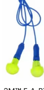
3M™ E-A-R™ Push-Ins™ Earplugs 318-1001, Corded, Poly Bag Learn more