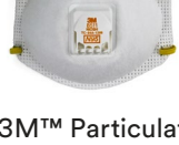
3M™ Particulate Respirator 8511, N95 Learn more