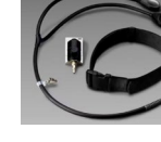
3M™ Dual Airline Back-Mounted Adapter Kit SA-2000 Learn more