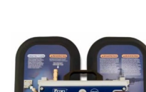
3M™ DBI-SALA® Vacuum Anchor Lifeline System Learn more