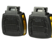
3M™ Secure Click™ Organic Vapor/Acid Gas Cartridge D8003 Learn more