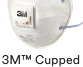
3M™ Cupped Particulate Respirator 8822, P2, Valved Learn more