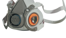
3M™ Half Facepiece Reusable Respirator 6200 Learn more