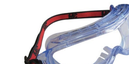
3M™ GoggleGear™ 500 Series Safety Goggles Learn more