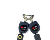
3M™ DBI-SALA® Nano-Lok™ Personal Self Retracting Lifeline, Twin-leg, Web, 3101719 Learn more