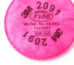
3M Particulate Filter 2091 P100 Learn more