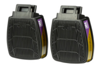
3M™ Secure Click™ Multi-Gas/Vapor Cartridge/Filter P100 D80926 Learn more