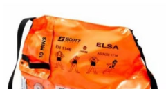
3M™ Scott™ ELSA Emergency Life Support Apparatus Learn more