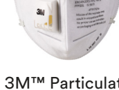
3M™ Particulate Respirator 9504INV (FFP2, BIS, Valved) Learn more