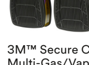
3M™ Secure Click™ Multi-Gas/Vapor Cartridge/Filter P100 D80926 Learn more