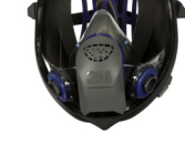
3M™ Secure Click™ Full Facepiece Reusable Respirator FF-800 Series Learn more