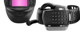
3M™ Speedglas™ Welding Helmet G5-01 with 3M™ Adflo™ Learn more