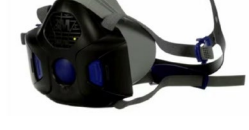
3M™ Secure Click™ Reusable Half Mask Respirator HF-800 Learn more