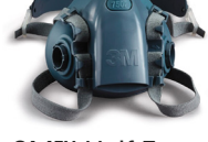
3M™ Half Facepiece Reusable Respirator 7502 Learn more