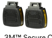
3M™ Secure Click™ Multi-Gas/Vapor Cartridge D8006 Learn more