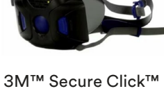
3M™ Secure Click™ Reusable Half Mask Respirator HF-800 Learn more