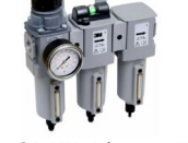
3M™ Aircare™ Filtration Unit ACU-03, Wall Mounted Learn more