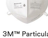
3M™ Particulate Respirator 9502+N95 Learn more