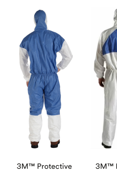
3M<sup>™</sup> Protective Coverall 4535 Coverall 4540+ Learn more