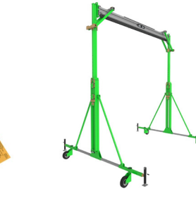
3M™ DBI-SALA®-FlexiGuard™ A-Frame System Learn more