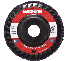
Scotch-Brite™ Clean and Strip XT Pro Disc