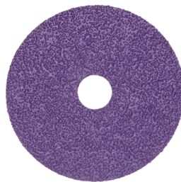
3M™ Cubitron™ II Fibre Disc 982CX Pro Center Hole, 36+

Reduce steps and help mitigate hazards while grinding welds and preparing for paint with 3M™ Cubitron™ II and Scotch-Brite™ Precision Surface Conditioning Discs.