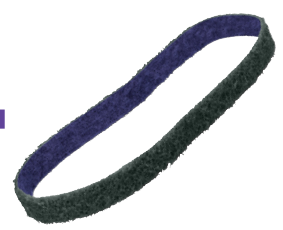
3M™ Cubitron™ II Cloth Belt 984FX Pro, 36+