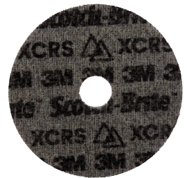
Scotch-Brite™ Precision Surface Conditioning Disc, Extra Coarse