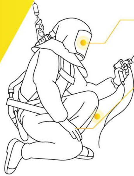
Confined Space Solution

Identify and stay ahead of hazards at your workplace.