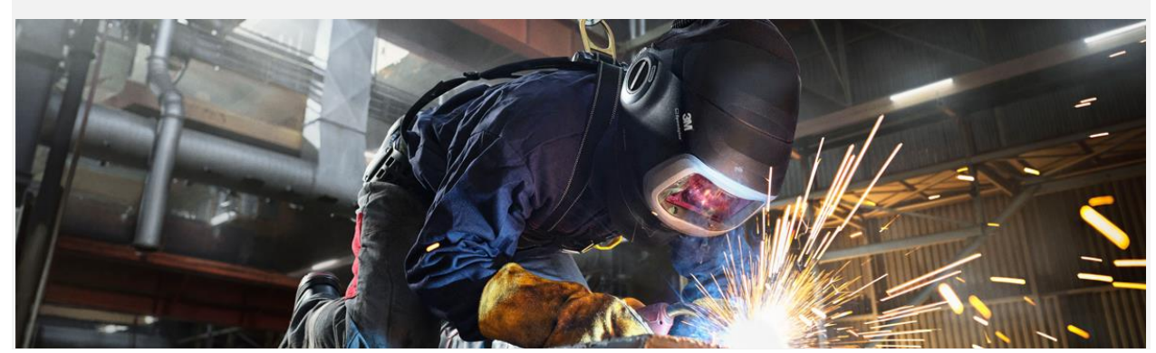
by SafetyNow - December 1, 2021