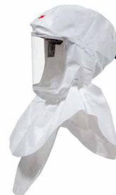
Premium Reusable Suspension Hood Assembly with Inner Shroud