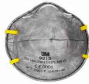
Speciality Particulate Respirator, FFP1, Unvalved, Nuisance Level Organic Vapor Relief