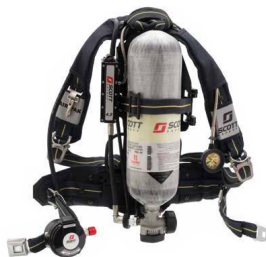
3M™ Scott™ Air-Pak 75i SCBA (NIOSH)