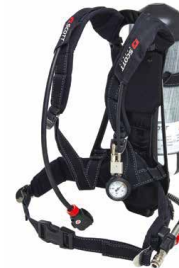
3M™ Scott™ ProPak (EN)