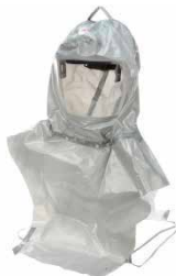
Premium Reusable Suspension: Hood Assembly with Sealed Seams and Inner Shroud