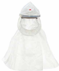
Integrated Head Suspension Economy Hood with Inner Shroud