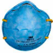
Speciality Particulate Respirator, FFP1, Unvalved, Nuisance Level Acid Gas Relief