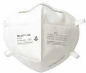
Particulate Respirator KN95, Unvalved