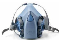
3M™ 7500 Series Half Facepiece / Mask ●●