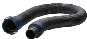
3M™ Versaflo™ Length Adjusting Breathing Tube