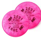
3M™ Particulate Filter P100