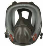
3M™ 6000 Series Full Facepiece / Mask ●●