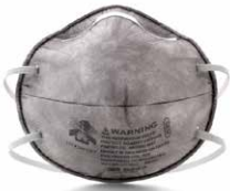
Particulate Respirator R95, Nuisance Level Organic Vapor Relief