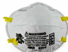
Particulate Respirator N95, Unvalved