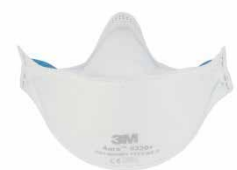
Aura™ Particulate Respirator, FFP2, Unvalved