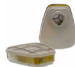
3M™ Multi-Gas / Vapor Cartridge