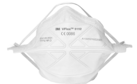
VFlex™ Particulate Respirator, FFP2, Unvalved