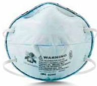
Particulate Respirator, R95, Nuisance Level Acid Gas Relief