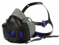
3M™ Secure Click™ HF-800 Half Facepiece / Mask ●