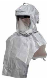
Premium Reusable Suspension Hood Assembly with Sealed Seams and Inner Neck Collar