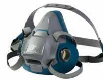
3M™ 6500 Series Half Facepiece / Mask ●●