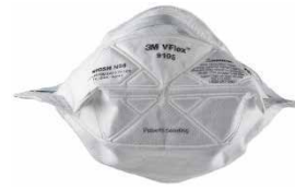
VFlex™ Particulate Respirator, N95, Unvalved