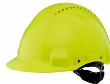
G3000 Series Helmets