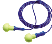
Pic: 3M™ Push-Ins Earplugs