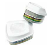
3M™ ABEK2P3R OV Gas and Vapour Combo Filter