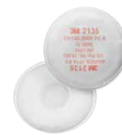
3M™ P3 R Particulate Filter