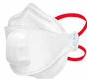
Aura™ Particulate Respirator FFP3, Shrouded Valve