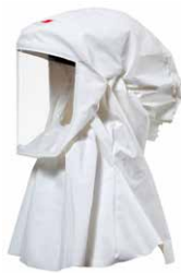
Integrated Head Suspension High Durability Hood with Face Seal