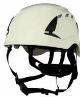
SecureFit™ 5000 Series Safety Helmet

3M™ delivers protection, comfort, and performance with complete solutions for head and face protection to accommodate the needs of your application or environment.