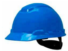
700 Series Hard Hat, 4-Point Ratchet Suspension