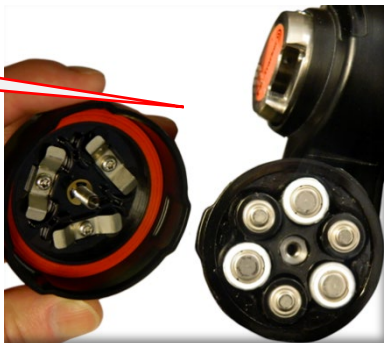
Figure 3: Remove Batteries