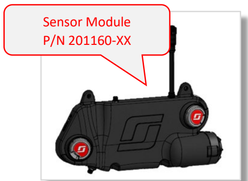
Figure 1: Pak-Alert Sensor Module