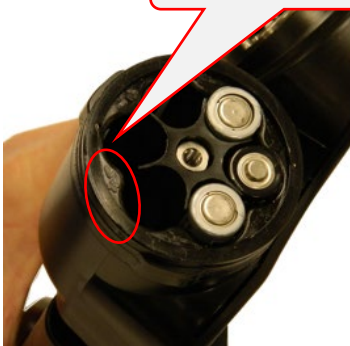
Figure 4: Polarity Marking

STEP 5: Carefully align and replace the battery cap.