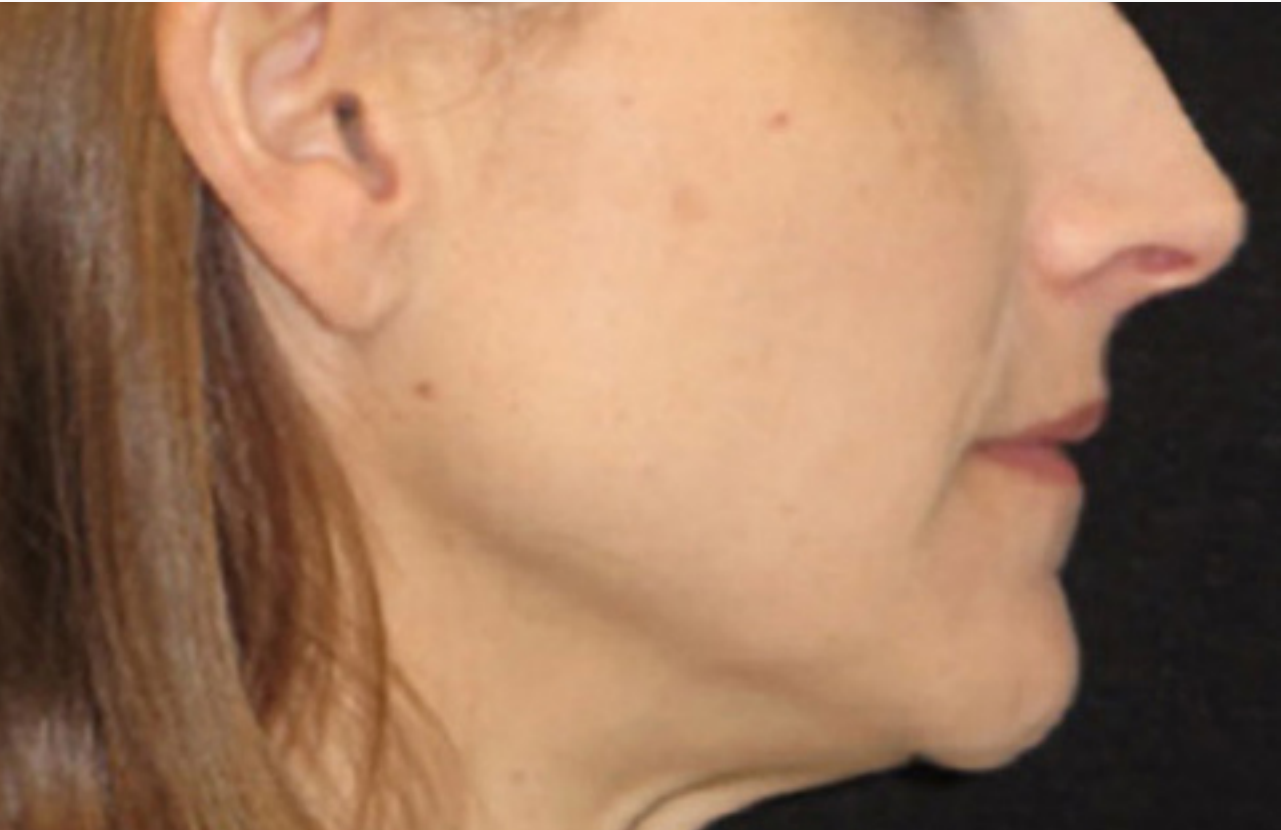
Profile at rest