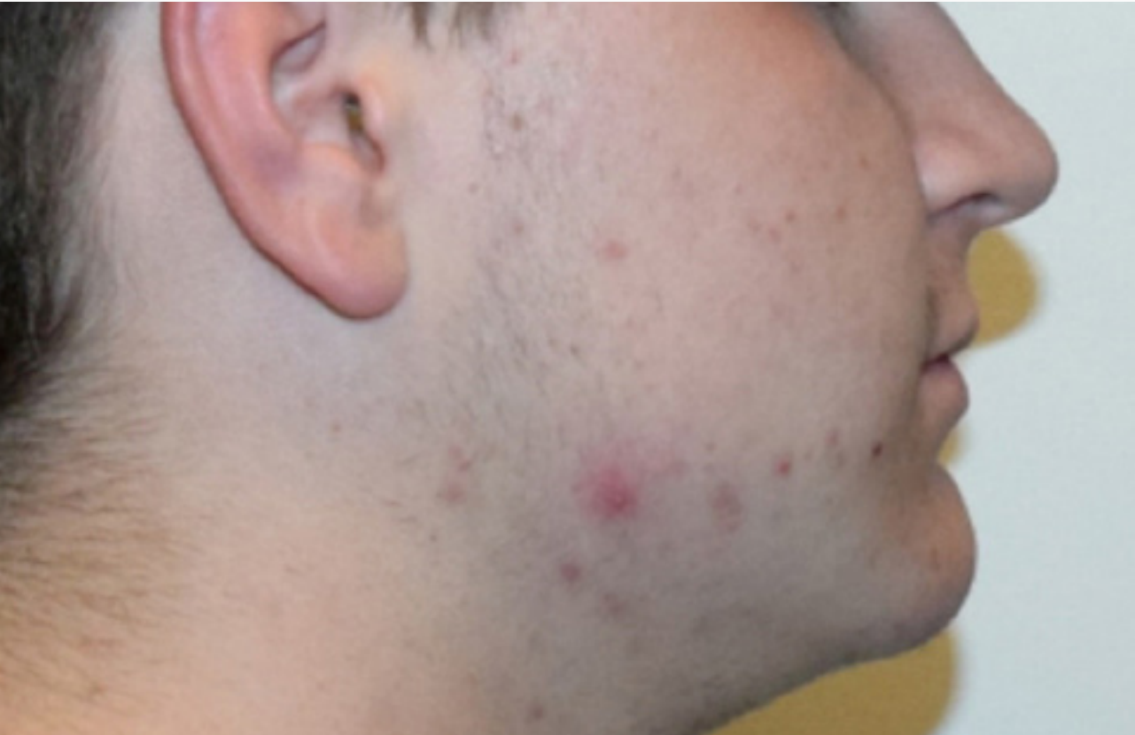
Profile at rest