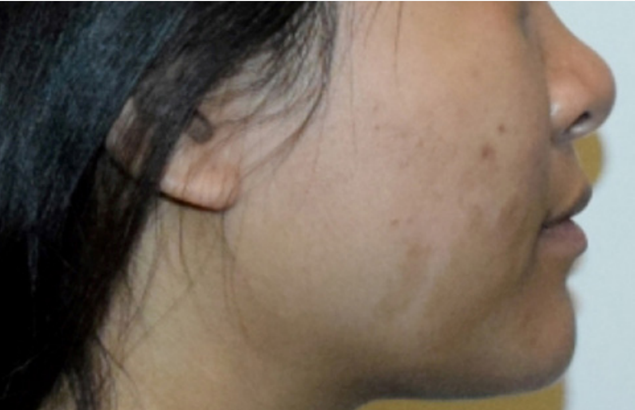
Profile at rest