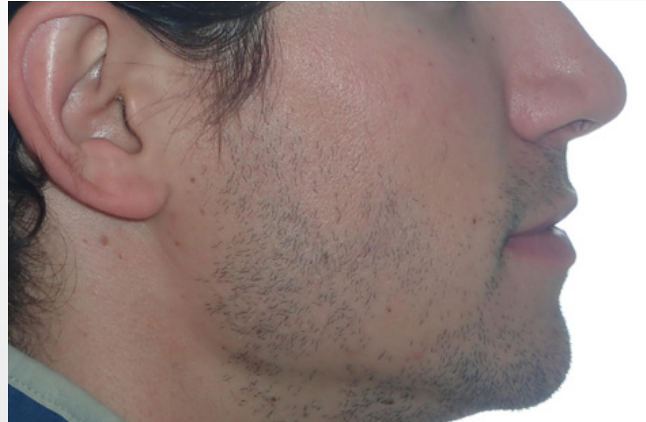
Profile at rest