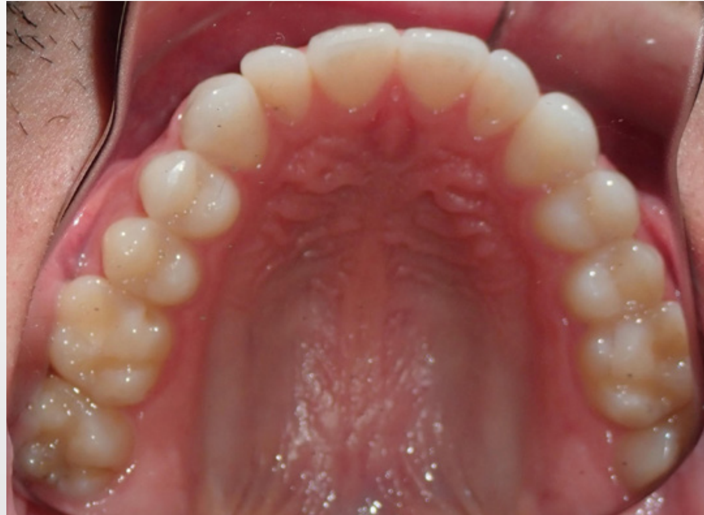
Occlusal – maxillary