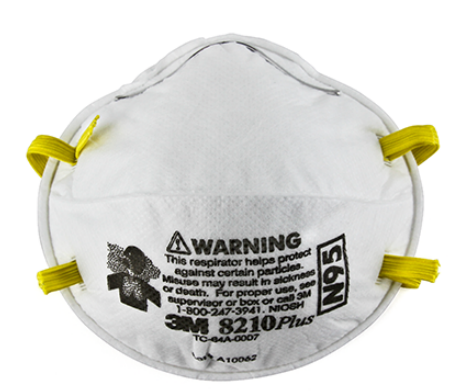
3M™ Particulate Respirator 8210Plus, N95