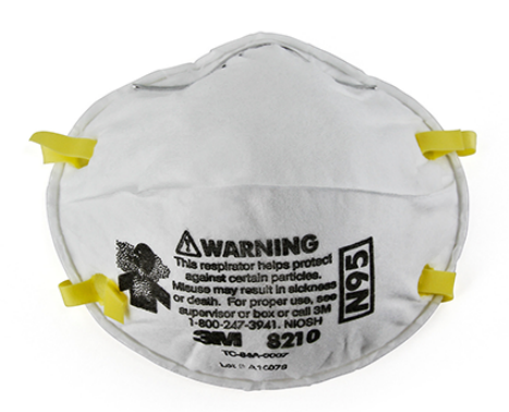
3M™ Particulate Respirator 8210, N95