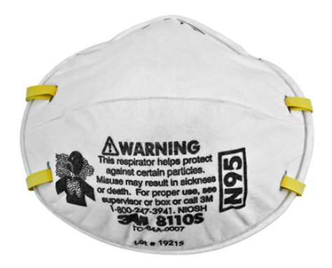
3M™ Particulate Respirator 8110S, N95