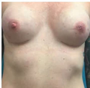
Figure 6. POD 65, incisions were completely healed, and both nipples were viable.