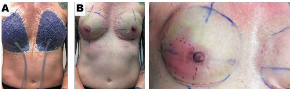
Figure 4. POD 6 postoperative follow-up visit. Prevena Restor™ Bella●Form™ Incision Management System was reapplied. A. Patient before the removal of Prevena Restor™ Bella●Form™ Dressing. B. Reconstructed breasts after removal of Prevena Restor™ Bella●Form™ Dressing and before the reapplication of 3M™ Prevena Restor™ Therapy.