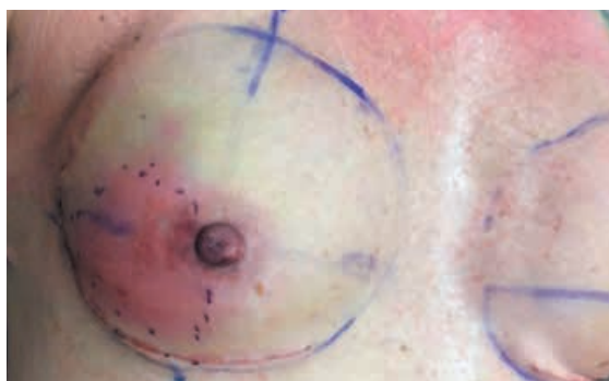
Figure 5. On POD 7, erythema was noted bilaterally on the reconstructed breasts after removal of Prevena Restor™ Bella●Form™ Dressing.