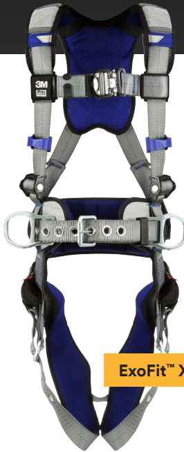
ExoFit™ X200 Harness