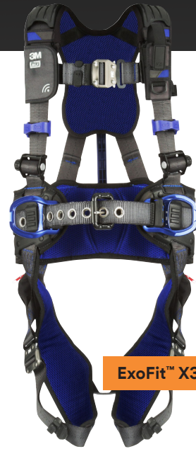
ExoFit™ X300 Harness