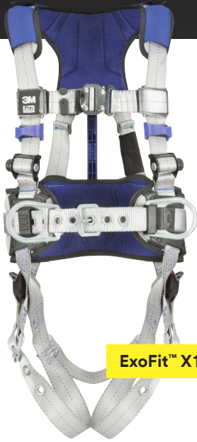
ExoFit™ X100 Harness