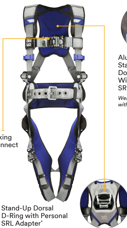
3M™ DBI-SALA® ExoFit™ X200 Harness