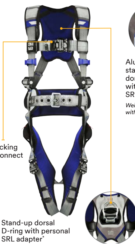
3M™ DBI-SALA® ExoFit™ X200 Harness