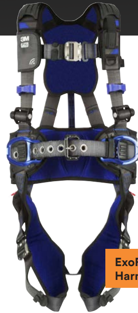
ExoFit™ X300 Harness