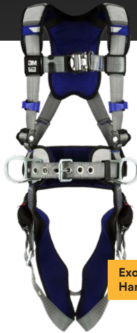
ExoFit™ X200 Harness