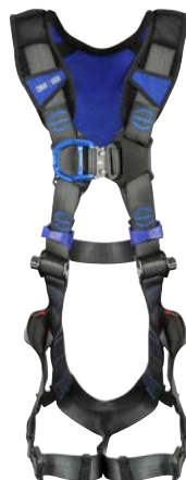
General Industry Climbing*