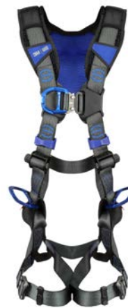
Climbing/Positioning (Wind Energy)*