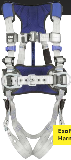
ExoFit™ X100 Harness