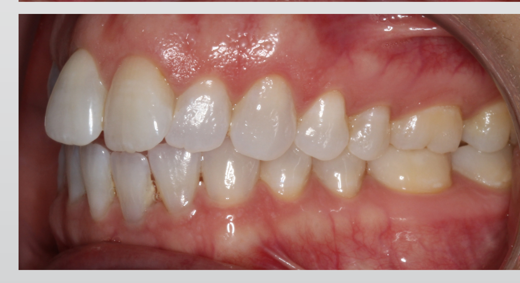
Retracted anterior biting