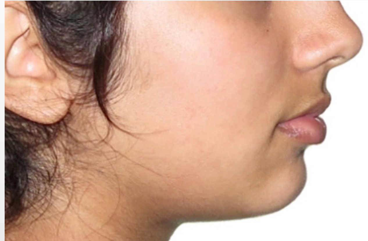
Profile at rest