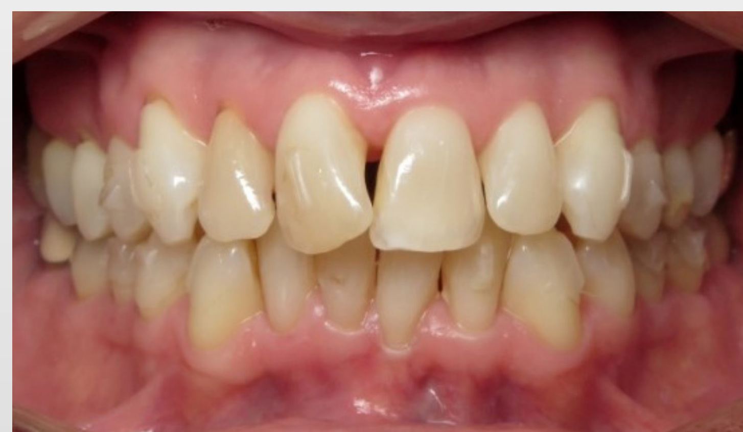
Retracted buccal – left