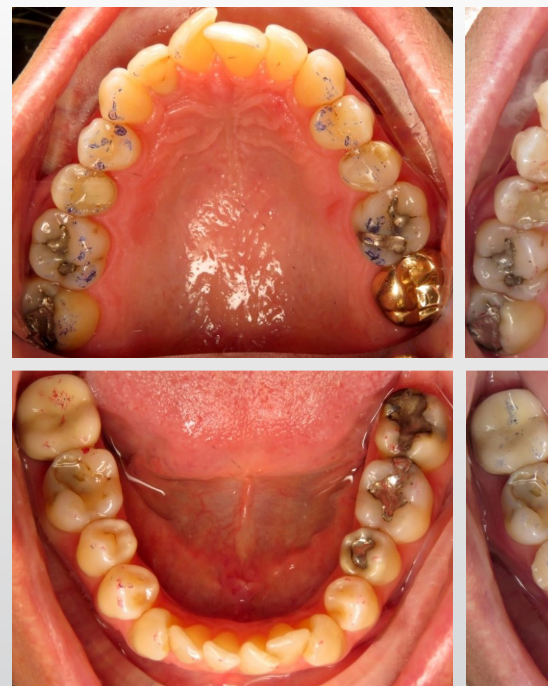
Occlusal – maxillary