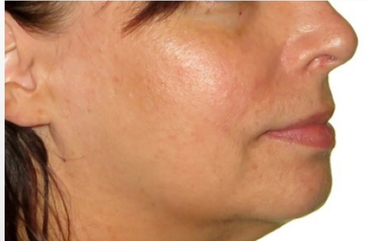
Profile at rest