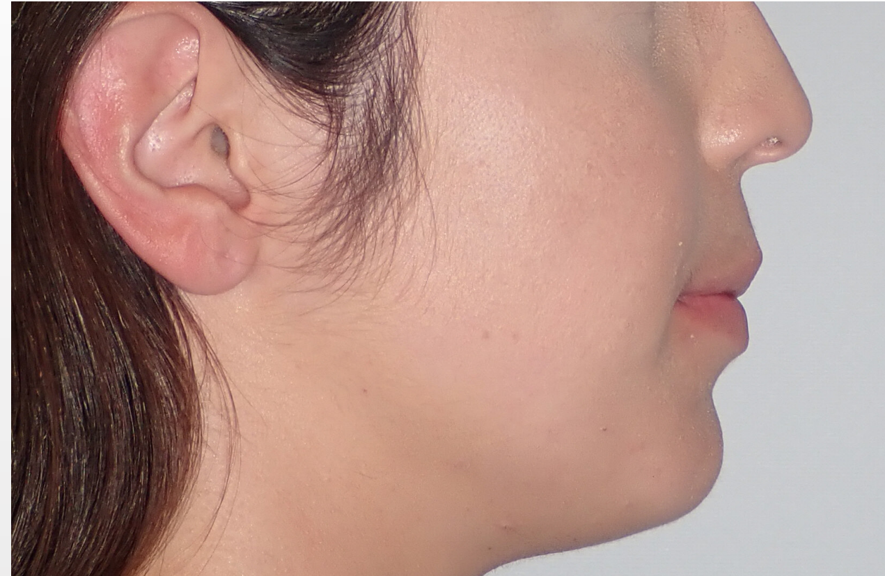
Profile at rest