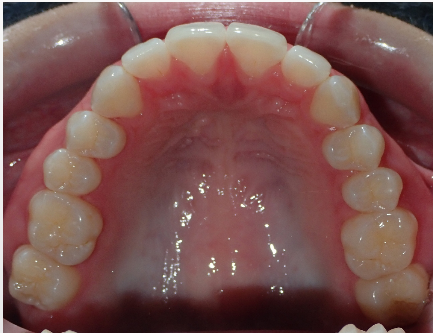
Occlusal – maxillary