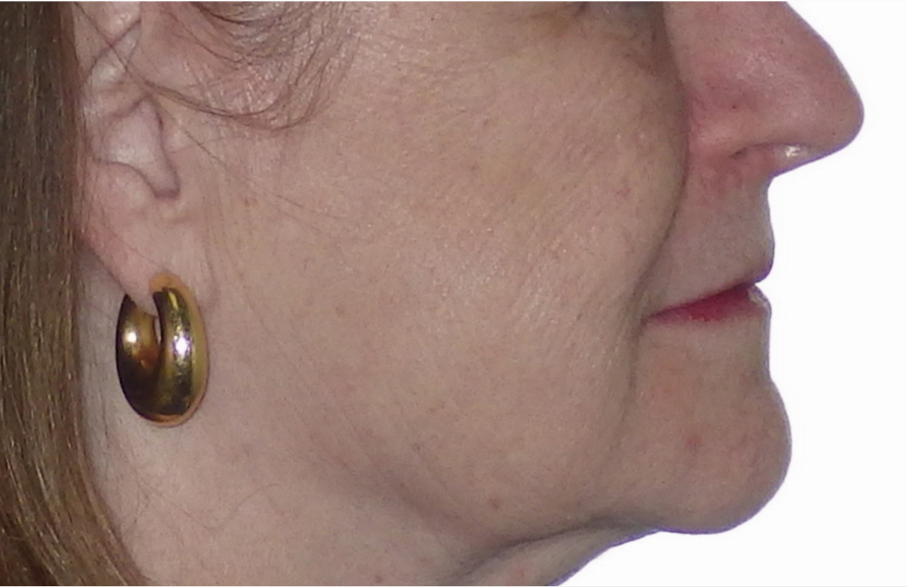
Profile at rest