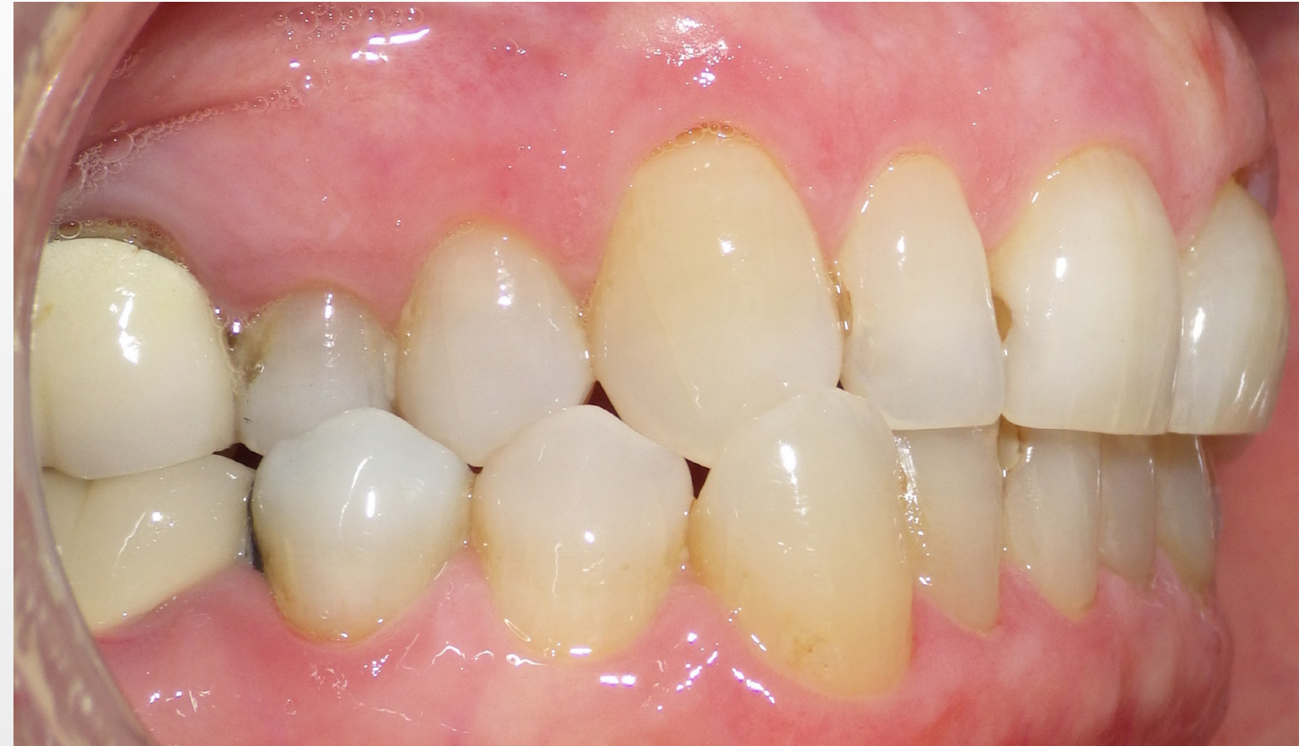
Retracted buccal – right