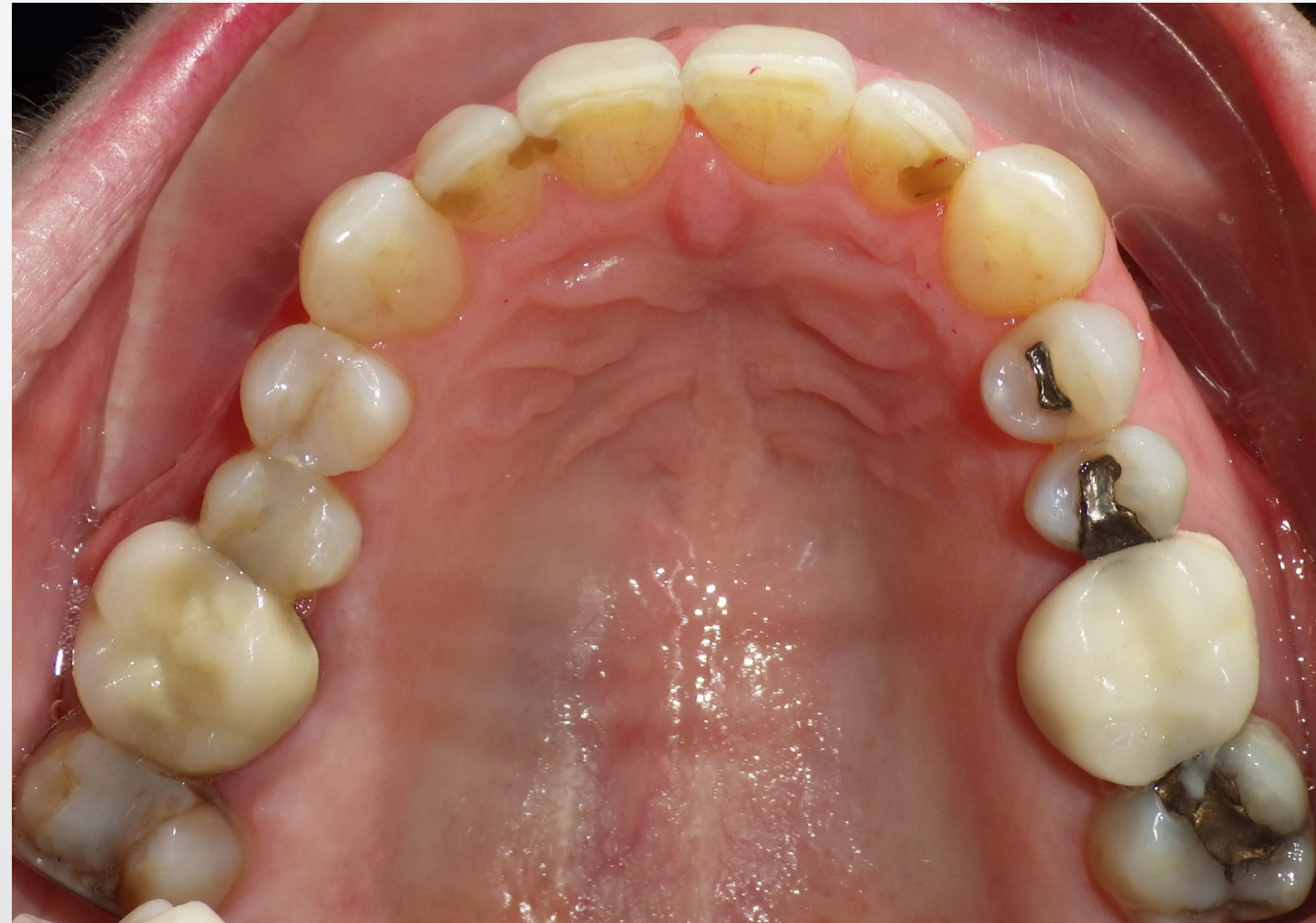
Occlusal – maxillary