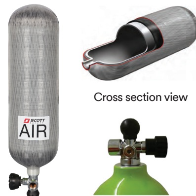
Right Angle Valve Cylinder