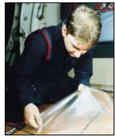
Pressure sensitive adhesive makes application of 8663 tape fast and easy.