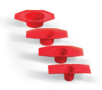
For use with 3M™ Fire Barrier Cast-In Devices in fluted steel pan decks.

1. Product Description 3M<sup>™</sup> Fire Barrier Cast-In Device Metal Deck Adaptors are one-piece plastic body assemblies for use with metallic or non-metallic 3M<sup>™</sup> Fire Barrier Cast-In Devices. The adaptors are used in new construction installations involving fluted metal decks with a minimum 2-1/2 in. (63.5 mm) concrete topping. The adaptor is available in sizes to accommodate single or multiple penetrants from 1-1/2 in. up to 6 in. total diameter (38.1 mm to 152.4 mm).