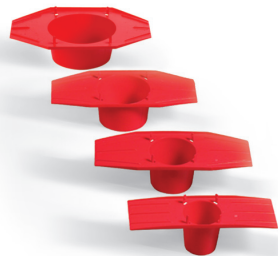
For use with 3M™ Fire Barrier Cast-In Devices in fluted steel pan decks.

3M™ Fire Barrier Cast-In Device Metal Deck Adaptors are one-piece plastic body assemblies for use with metallic or non-metallic 3M™ Fire Barrier Cast-In Devices. The adaptors are used in new construction installations involving fluted metal decks with a minimum 2-1/2 in. (63.5 mm) concrete topping. The adaptor is available in sizes to accommodate single or multiple penetrants from 1-1/2 in. up to 6 in. total diameter (38.1 mm to 152.4 mm).