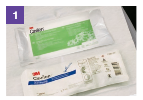
Set up your supplies on a clean surface.