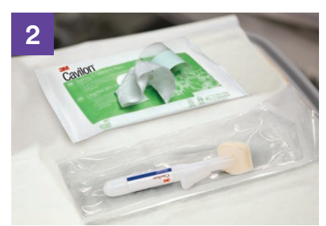
Open the package of Cavilon™ Advanced skin protectant and leave the applicator in the plastic pouch.