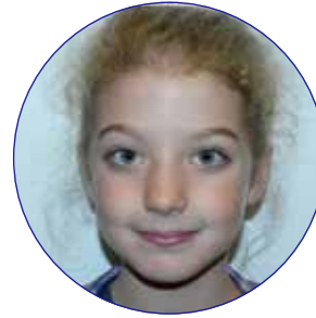
Face at rest ( initial )