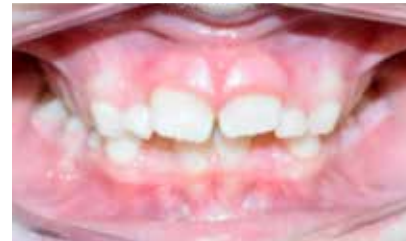
Retracted anterior biting ( initial )