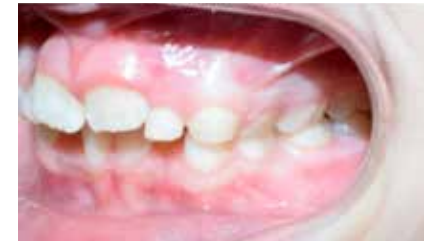
Retracted Buccal ( initial )