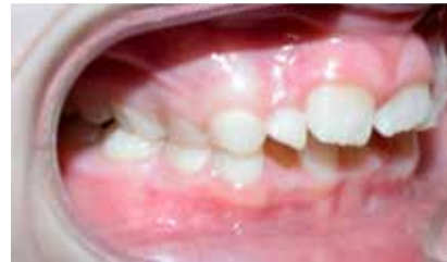
Retracted Buccal ( initial )