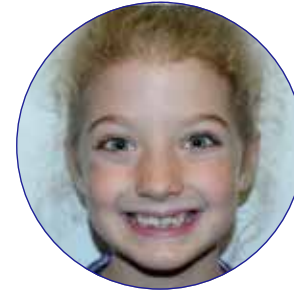
Face smiling ( initial )