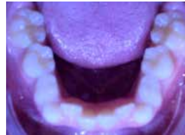
Occlusal – Mandibular ( initial )