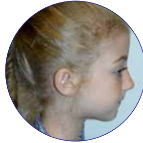
Profile at rest ( initial )