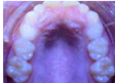
Occlusal – Maxillary ( initial )