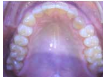
Occlusal – Maxillary ( initial )