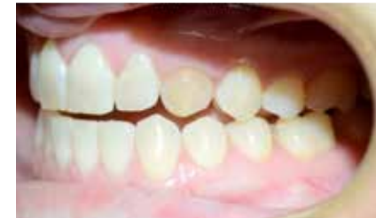
Retracted Buccal ( initial )