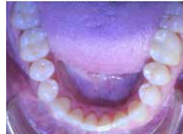
Occlusal – Mandibular ( initial )