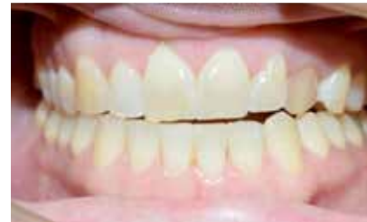
Retracted anterior biting ( initial )