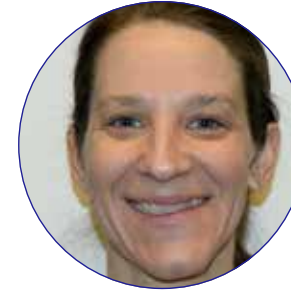
Face smiling ( initial )