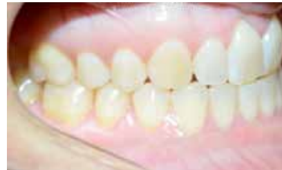
Retracted Buccal ( initial )