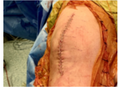
Figure 1. Closed surgical incision.