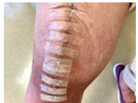
Figure 3. Surgical incision 7 days after 3M™ Prevena Restor™ Therapy System with 3M™ Prevena Restor™ Arthro•Form™ Dressing.