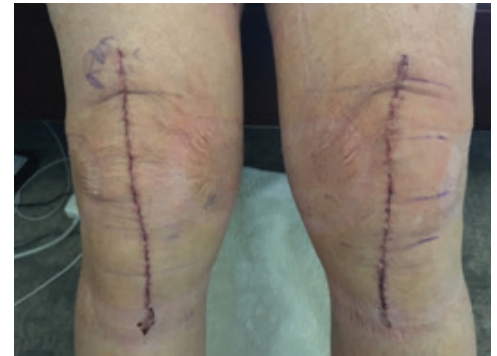
Figure 1. Bilateral total knee arthroplasty incisions after 7 days of Prevena Restor™ Arthro●Form™ Incision Management System use.

Specific indications, contraindications, warnings, precautions and safety information exist for these products and therapies. Please consult a clinician and product instructions for use prior to application. This material is intended for healthcare professionals.