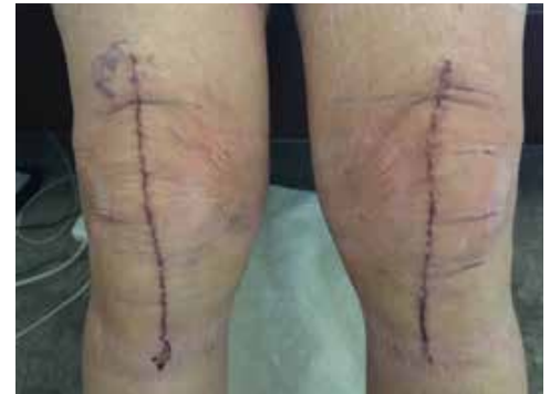
Figure 1. Bilateral total knee arthroplasty incisions after 7 days of Prevena Restor™ Arthro•Form™ Incision Management System use.

Specific indications, contraindications, warnings, precautions and safety information exist for these products and therapies. Please consult a clinician and product instructions for use prior to application. This material is intended for healthcare professionals.